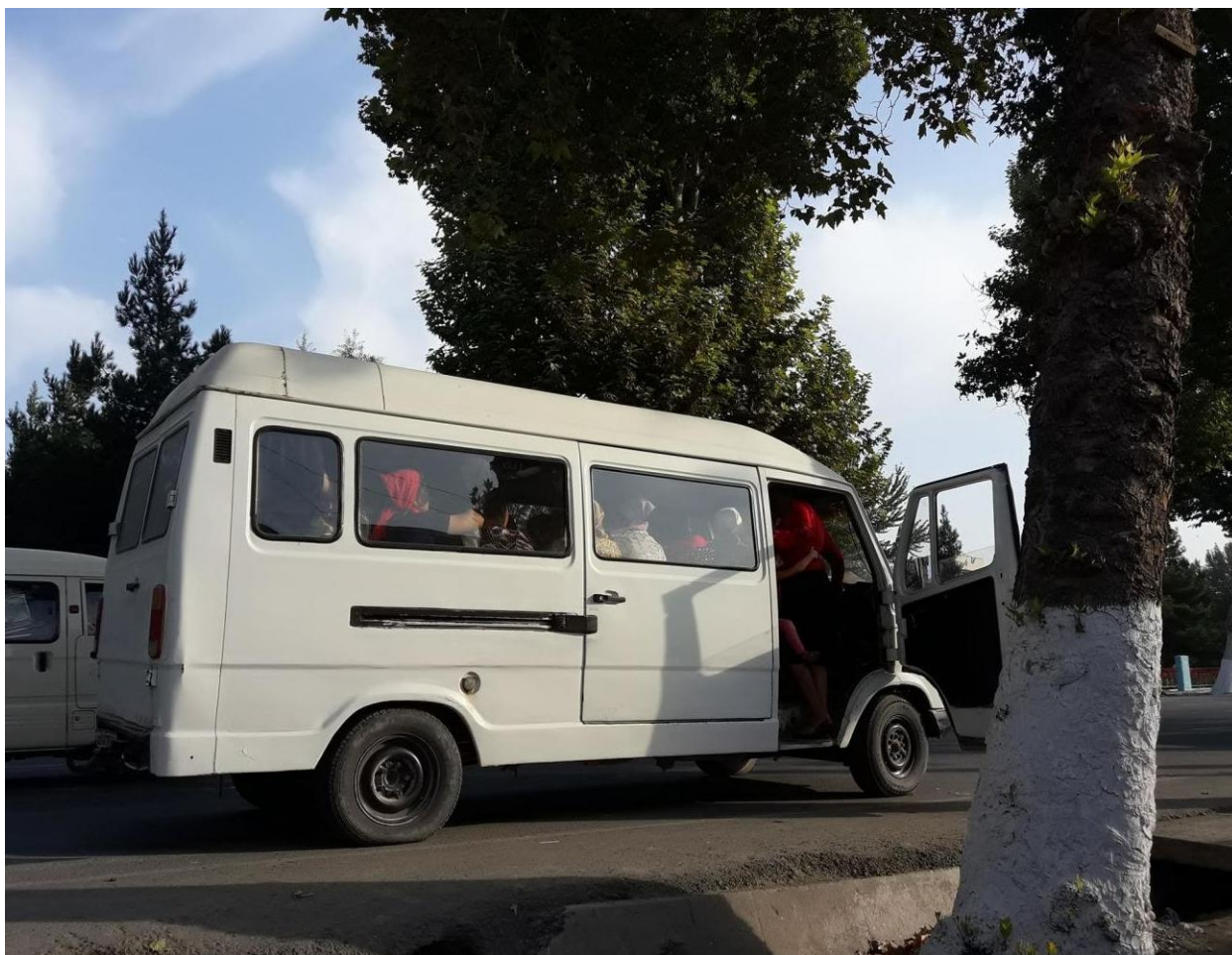
(Photo: Namangan, school teachers go in groups to harvest cotton, September 12, 2016)

In Uzbekistan on September 8, began the massive forced mobilization of students and employees of state organizations to harvest cotton. The first who have been sent to collect cotton were university students around the country. Students will be living and working in the cotton fields for almost 2 months before the end of the cotton season. According to students, who talked with UGF monitors prior to the departure, they were told to sign "a letter of voluntary participation to the cotton harvest."